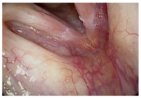
High-definition stroboscopic image