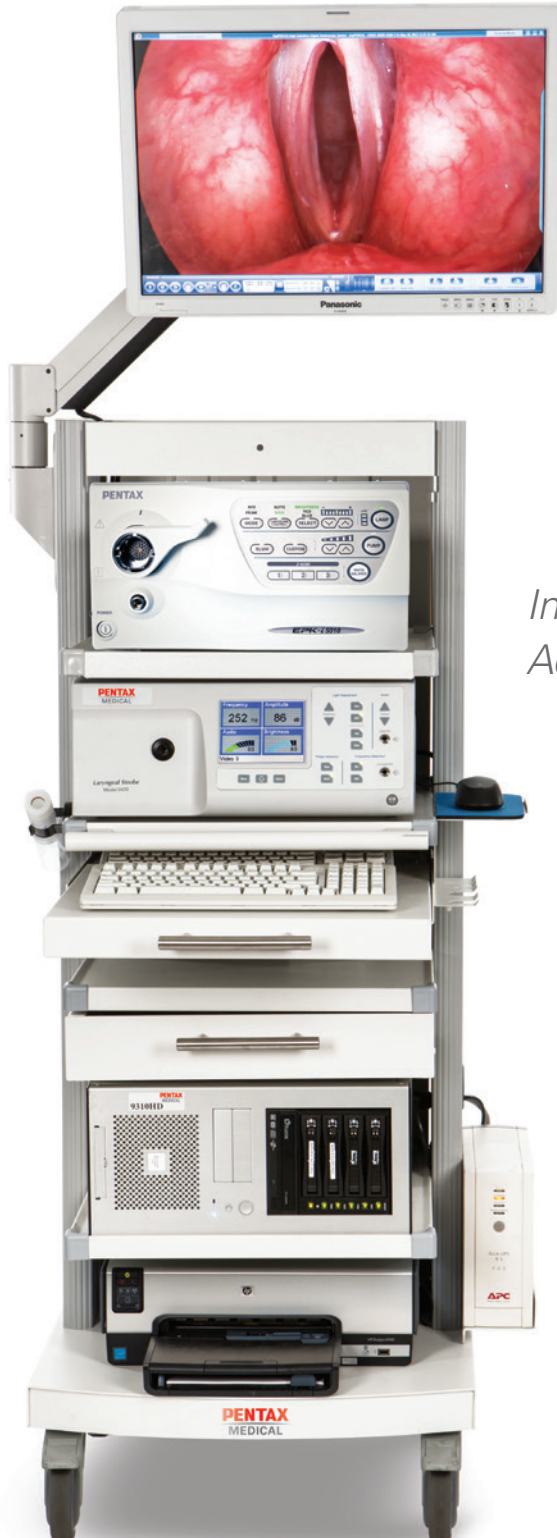
Image Quality, Clinically Relevant Advancements, and Workflow Efficiency